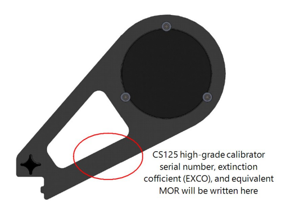
FIGURE 3-1. Red circle shows location of label with the MOR/TMOR reference value

Calibration discs show specific MOR/TMOR reference values unique to that calibration disc; see FIGURE 3-1. Contact Campbell Scientific if the MOR/TMOR is not shown on the disc.